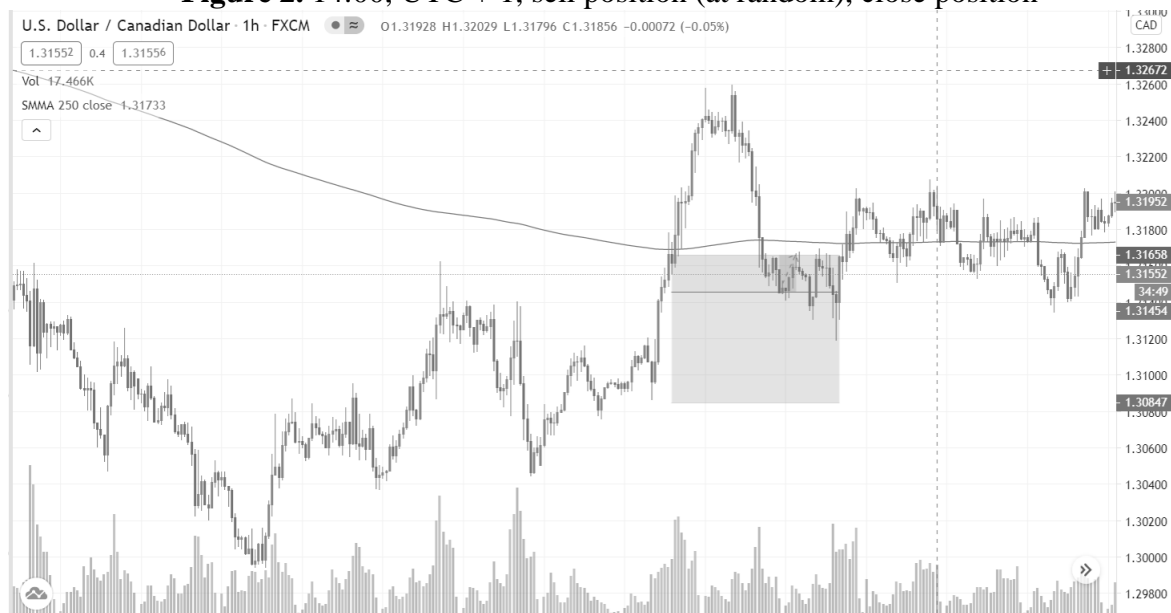
Figure 2. 14:00, UTC + 1, sell position (at random), close position