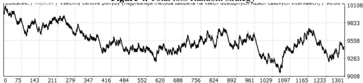
Figure 4. Total loss Random strategy

Source: Author's calculations, MetaTrader